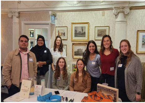
Golden Z Members at the Brunch

The Golden Z Club has been very active thus far this year. In October, the Golden Z students helped out by selling raffle tickets at our Champagne Brunch. In November, the Golden Z Club at Utica University participated in the Sixteen Days of Activism and hosted a screening and panel discussion of the movie, Barbie, in partnership with the campus Women's Resource Center.